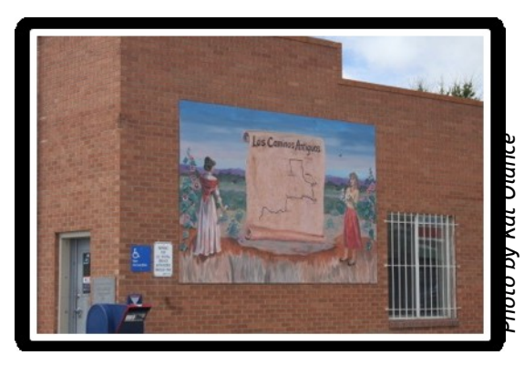
LCA Mural Mural with a map of the Los Caminos Antiguos Scenic Byway on the sidewall of the Fort Garland Post Office.

churches – San Acacio and Our Lady of Guadalupe. Our Lady of Guadalupe's directional sign lists it as oldest church, but interpretative sign indicates the church building burned down?