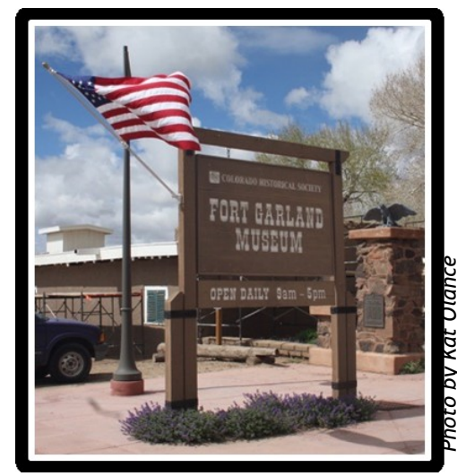
Fort Garland Museum, a state owned museum in Fort Garland, CO

After the conclusion of the wayfinding exercise, participants were asked to record observations and make recommendations based on their on-the-road experience. A full list of the comments and observations by the two teams is found in the Appendix.