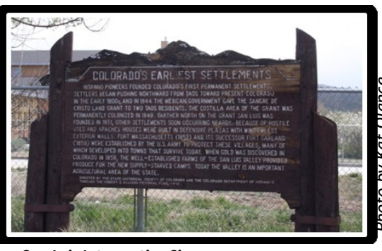
San Luis Interpretive Signage

Interpretive sign on a dirt pull-off off on Hwy 159, at the north end of San Luis, is difficult for visitors to find or access.