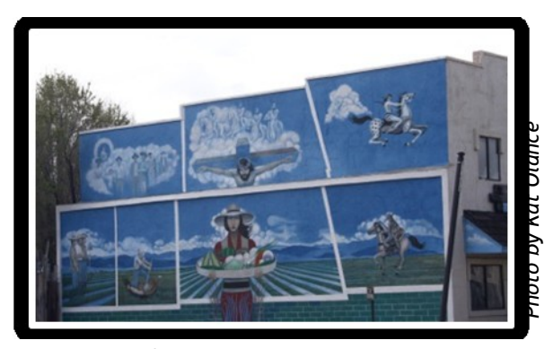
LCA Mural One of a series of murals on Main Street in the town of San Luis.