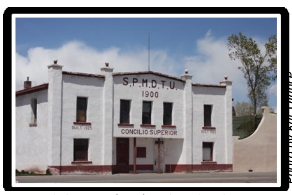
Sociedad Protección Mútua de Trabajadores Unidos, Antonito, CO

• Develop wayfinding signage within each town