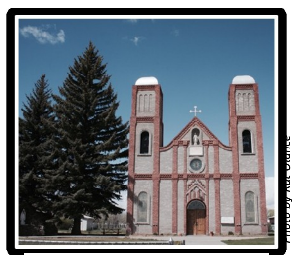
Our Lady of Guadalupe Church