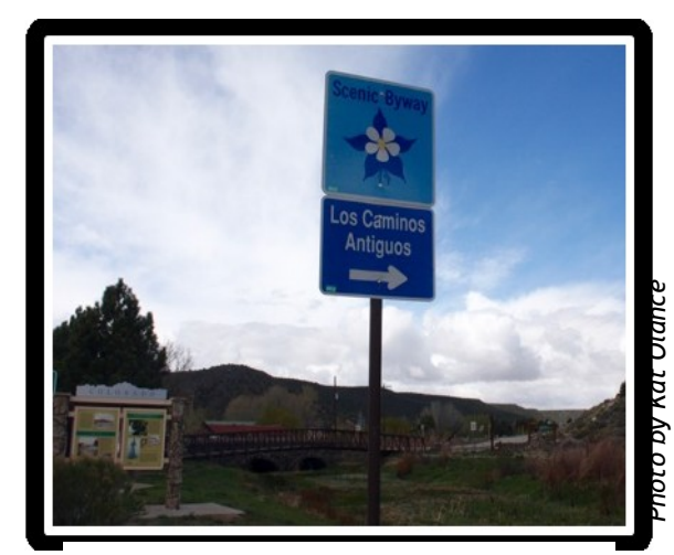
Scenic Byway Columbine Sign Columbine sign at the intersection of Hwy 159 and County Rd 142 in San Luis.

Following a day on the road, the assessment team listed the three top attractions as The Great Sand Dunes National Park, Zapata Falls and the Stations of the Cross. The first two have good directional signage, but the Stations of the Cross does not. The assessment team eventually located all the listed sites, but in many cases passed them, then were required to make a U-turns to return. Prenotification signage would help prevent doubling back.