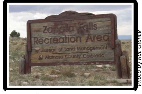
Zapata Falls Entrance sign at turnoff on Hwy 150. Is easily seen, but needs maintenance.

H. Interpretative signs are needed for the Zapata Ranch, the San Luis Valley Museum, Cole Park, Luther Bean and Ryan Geological Museums, San Luis Lakes State Park, Blanca hiking, Zapata Falls, Stations of the Cross, museum in San Luis, Religious Heritage Tours, First Mercantile (aka R&R Market), City of Murals, Costilla Courthouse, Gallegos Centennial Farm, Our Lady of Guadalupe.