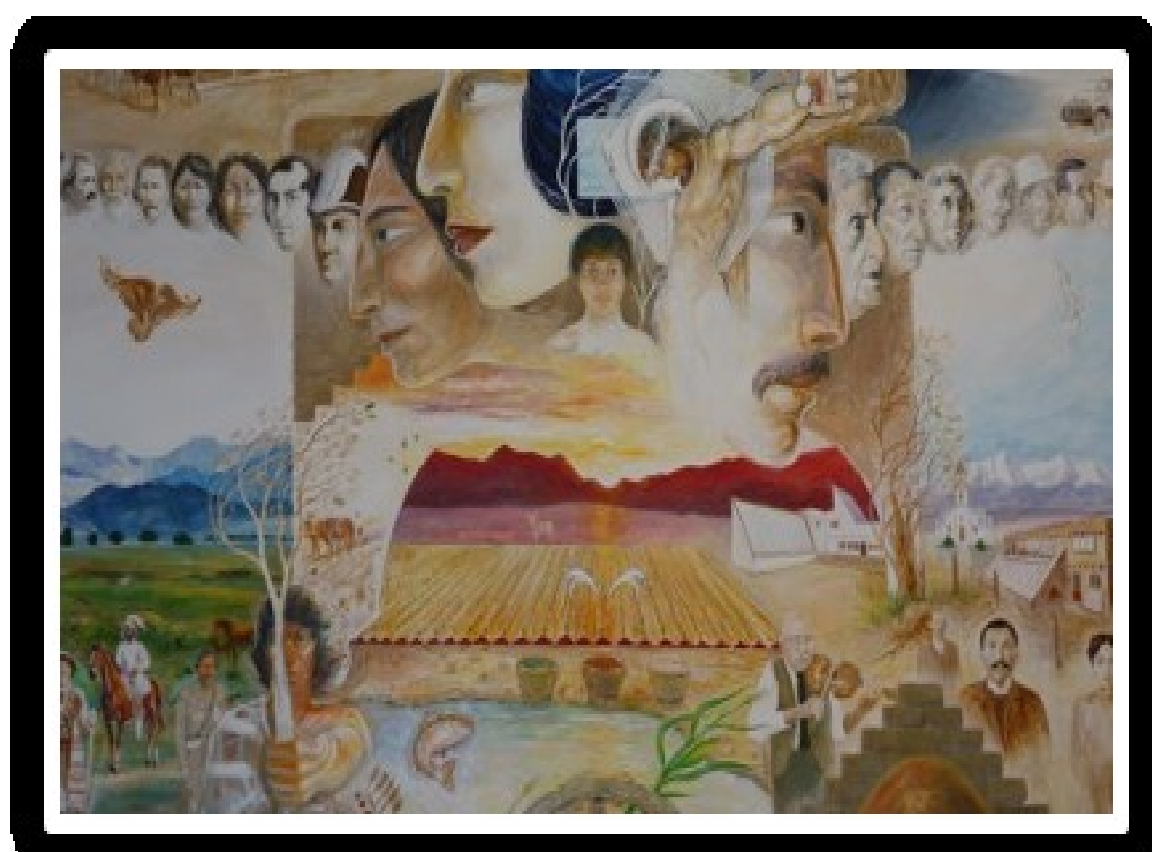
The mural in Sangre de Cristo Heritage Center, San Luis

A $90,000 grant awarded in 1996 funded the writing of the Corridor Management Plan (CMP) and Interpretive Plan. The next year, $63,200 was secured to produce a Public Broadcast System documentary on the cultural aspects of the Byway. In 1999, another $47,440 was awarded to produce a tour of Hispano Mission Churches.